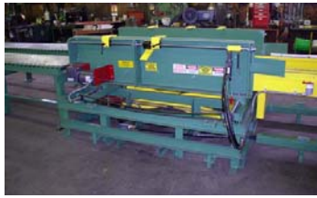
All hydraulic Stacker. GBN uses this on all its systems.