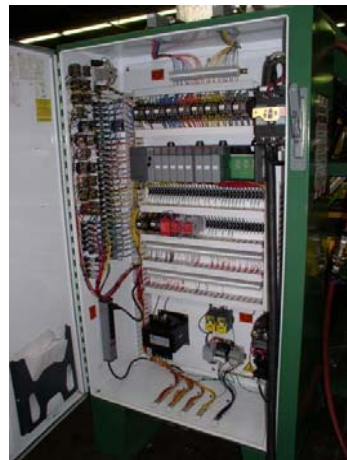
Allen Bradley electrical controls includes the SLC 503 series Processor.