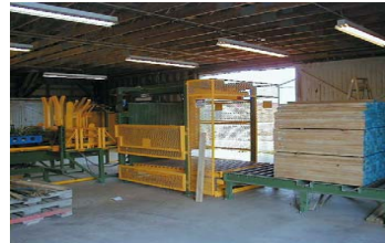
Fully Automatic Stringer Feeder, no labor.