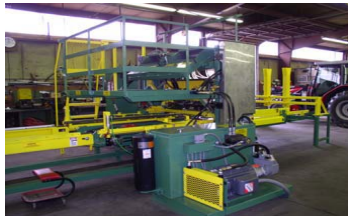
Simple, efficient Hydraulic Power. Oversized Nail Cat Walk for safe nail loading.