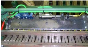
Excalibur uses new "Linear" Nail Picking System for accuracy.