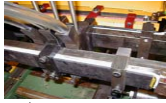
Air Clamping, no wrenches means faster changes. Compensating Chucks.