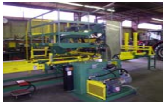
Simple, efficient Hydraulic Power. Oversized Nail Cat Walk is for safe loading.