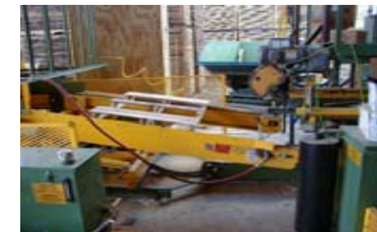
Half Pallet returned under nailer, not through it.