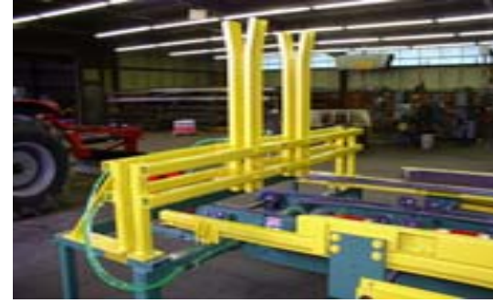
Hopper for Stringers, the GBN Mini Feeder.