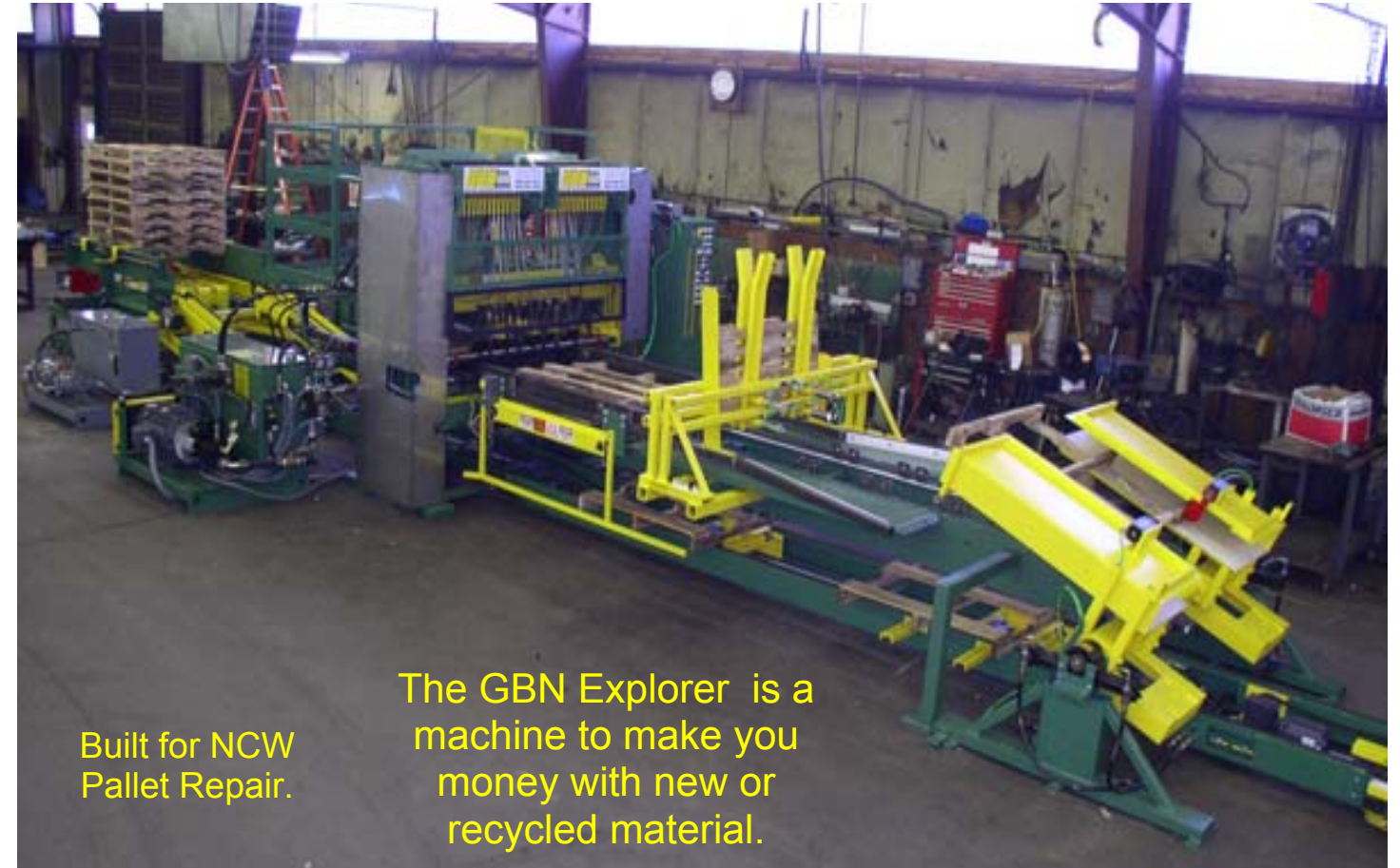
Built for NCW Pallet Repair.