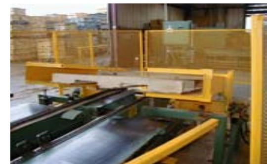
Automatic Turner. No Manual labor involved.