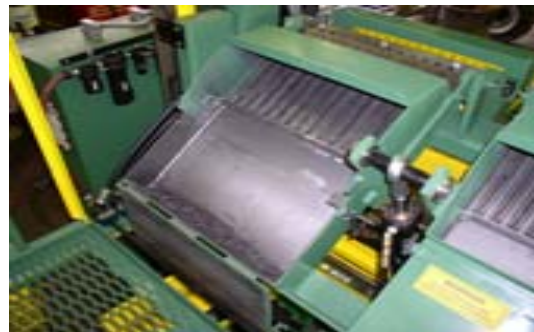
2 Nail Pans hold 100 lbs. of loose nails and have quick unloading.