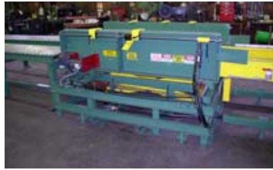
All hydraulic Stacker. GBN uses this on all its systems.