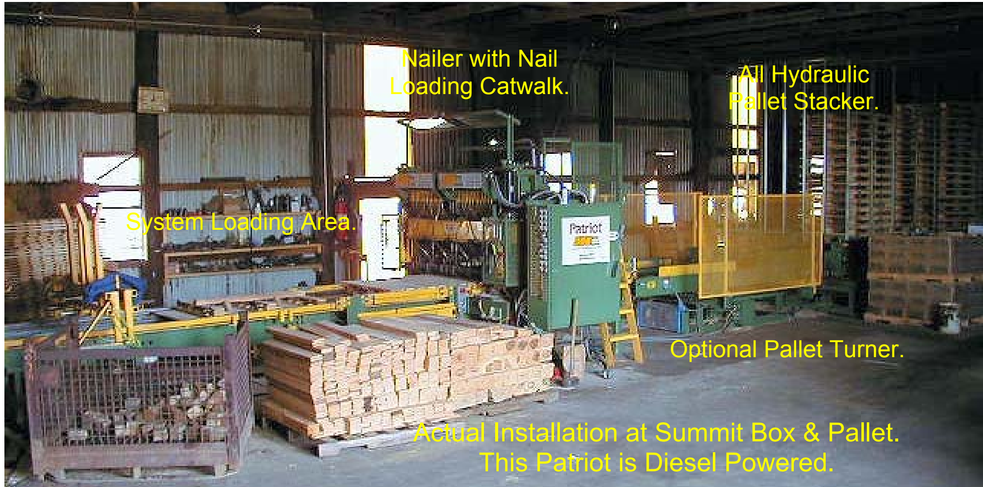
Nailer with Nail Loading Catwalk.