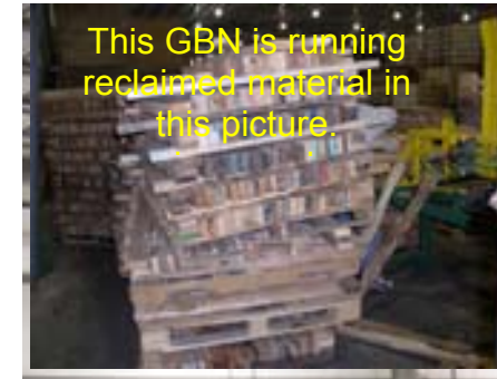
This GBN is running reclaimed material in this picture.