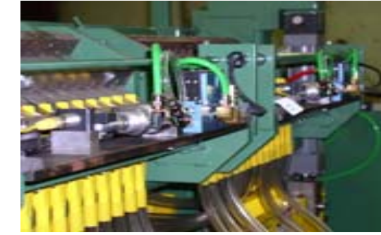
New Linear Nail Picks. Near Fool Proof Accuracy.