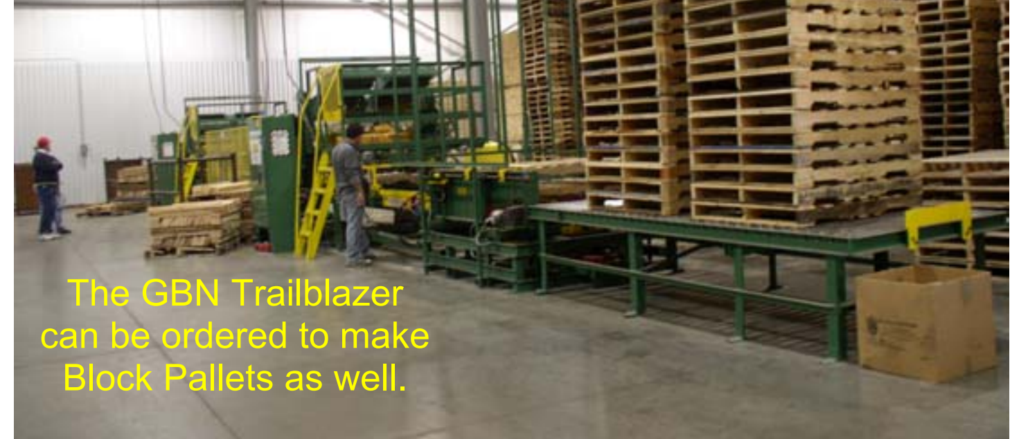
The GBN Trailblazer can be ordered to make Block Pallets as well.