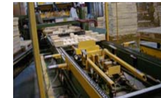
Automatic Turner. No Manual labor involved.