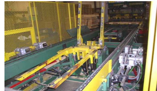
Turner with Optional Brander.