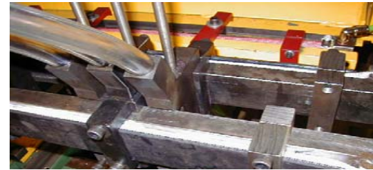
Air Clamping, no wrenches means faster changes. Compensating Chucks.