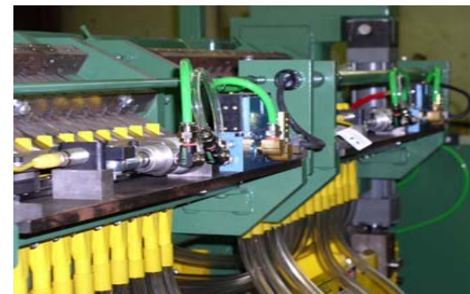
New Linear Nail Picks. Near Fool Proof Accuracy.