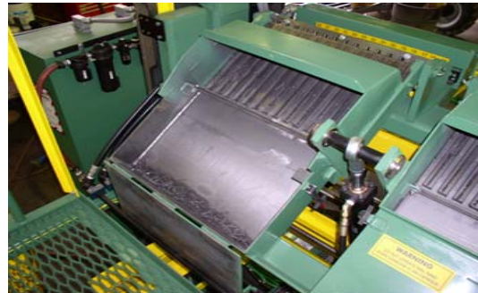
2 Nail Pans hold 100 lbs. of loose nails and have quick unloading.