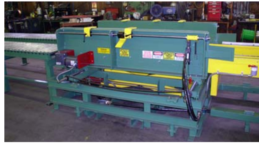
All hydraulic Stacker. GBN uses this on all its systems.