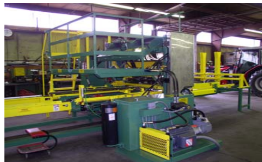
Simple, efficient Hydraulic Power. Oversized Nail Cat Walk is for safe loading.