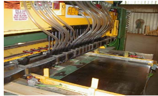
Jigless Automatic, Quick Change Table. Other options available.