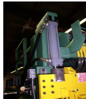
Exclusive two dimension cylinder alignment.

GBN MACHING & ENGINEERING CORP. offers the years of experience and engineering to design options to your exact specifications.