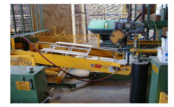
Half Pallet returned under nailer, not through it.