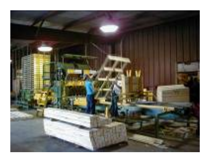
Versatile Patriot: and Productive, a great performer with fast changeover.