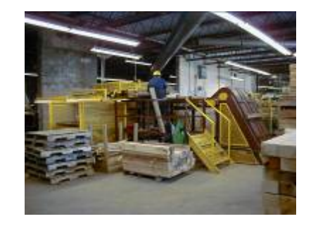
The GBN REDI STAK is the best pallet material stacker on the market.