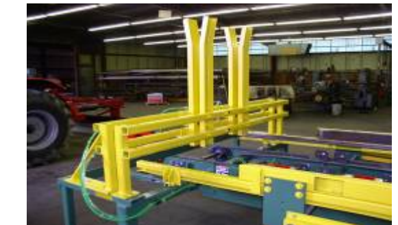
Hopper for Stringers, the GBN Mini Feeder.