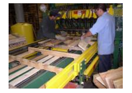
Trailblazer: A basic and productive two nailer system. (Running Recycled)