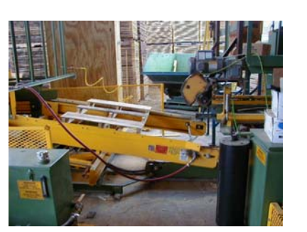
Explorer : That 1000 per day, 2 person system, you really want.