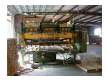
Assembly Series: Fast Changeover with 60, 72 and 100 Inch Models.