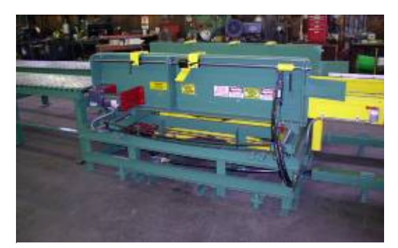
All hydraulic Stacker. GBN uses this on all its systems.